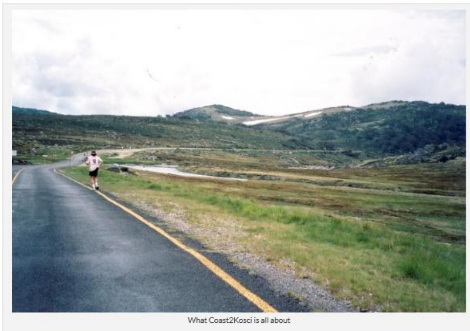
What Coast2Kosci is all about

In just a few days time, 45 carefully selected ultra-marathon nutters will begin their journey from Eden on the South Coast of NSW to what is the highest point in Australia, Mount Kosciuszko. For many of us on the ultra-marathon scene, that picture below tells us everything we need to know about this race. In my mind, its iconic and will forever be the one picture that you associate with this race.