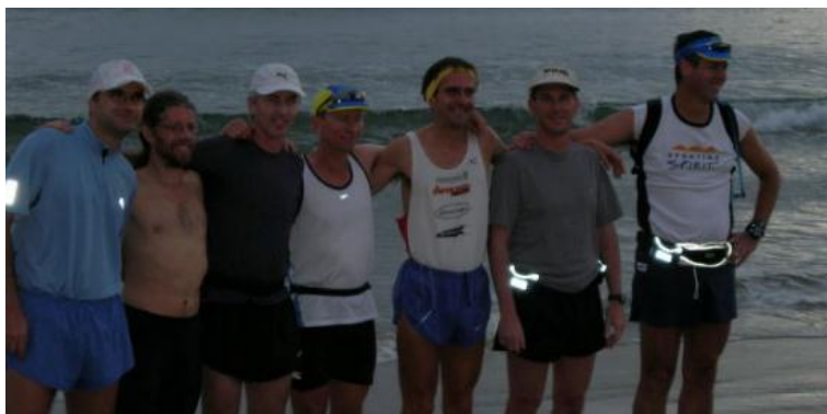
The startline from years gone by. What started out as a small band of runners is now an Internationally recognised event